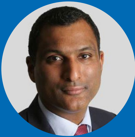
Lord Kamall, Parliamentary Under Secretary of State (Minister for Technology, Innovation and Life Sciences)

“ Making it easier to conduct high quality research that people can trust, by partnering with patients and the wider public, will make the UK a hub to deliver more world-leading, life-changing breakthroughs in science which will also improve the health of our nation.